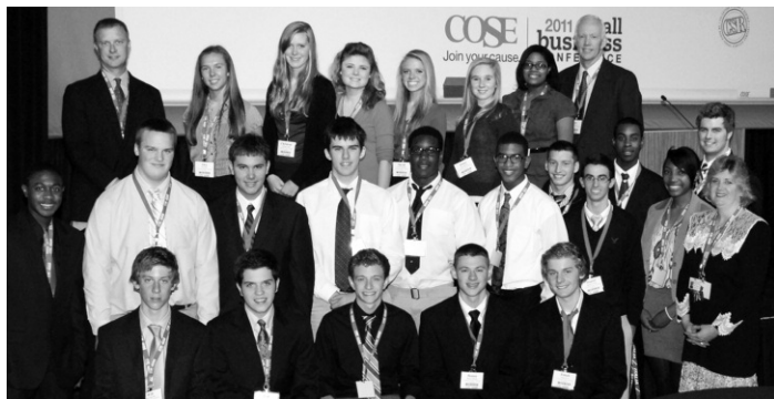
SOBE students on a field trip to the IX Center

The next event for all members will be the Christmas Party, so be on the lookout for upcoming information on this luncheon in December.