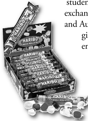
Gummy Roulettes $9.00/18 count $18.00/36 count