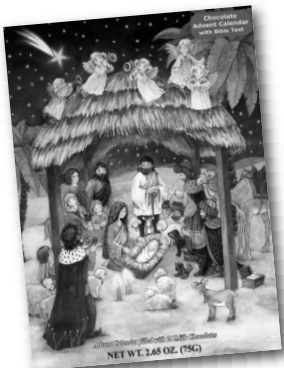
Gourmet Chocolate Nativity Advent Calendar, $5.00