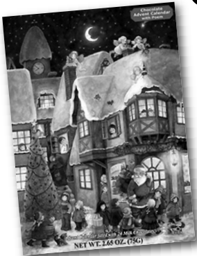
Chocolate Santa Advent Calendar, $3.00