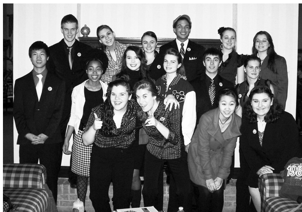
Talking Royals at Ohio High School Speech and Debate Tournament

CVCA's Talking Royal Speech and Debate team had an outstanding 2010-11 year. Over thirty students in grades 9-12 were in competition from the first week in November to first week in March. Some of the highlights of the year were the team's fifth place finish at the 9th Annual CVCA Holiday Classic, a third place finish at the Berea Grindstone Tournament and a third place finish at the Greater Akron District Tournament. The highlight of the season was when the team qualified a record 18 students to the 84th annual Ohio High School Speech and Debate Tournament in Toledo in March. Making it to the tournament were the following students: