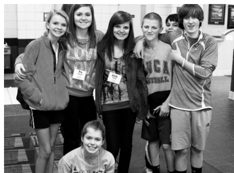
"Winterblast" for Junior High Students