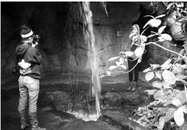
"God's Creation Through the Eyes of Photography" – CVCA students at the Cleveland Zoo Rainforest