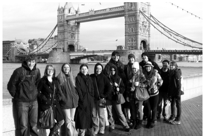
CVCA students in London for "A Literary Tour of London"